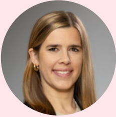
Elisabeth Margue, Minister of Justice